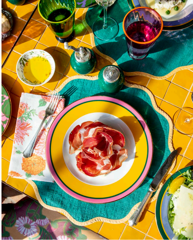
FROM LEFT: Lunch at Passalacqua is fresh and unfussy; Live la dolce vita at the hotel's chic pool. OPPOSITE: A few doors down from Grand Hotel Tremezzo, the 16th-century aristocratic residence Villa Sola Cabiati can be rented out for an ultra-private stay.