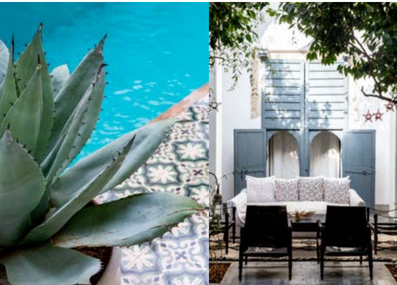
FROM LEFT: Riad Mena & Beyond boasts an outdoor heated pool; Dar Karwa is based in a 17th-century townhouse; The towering Koutoubia Mosque; Cacti in Jardin Majorelle; Shopping for Berber rugs is a must in the souks.